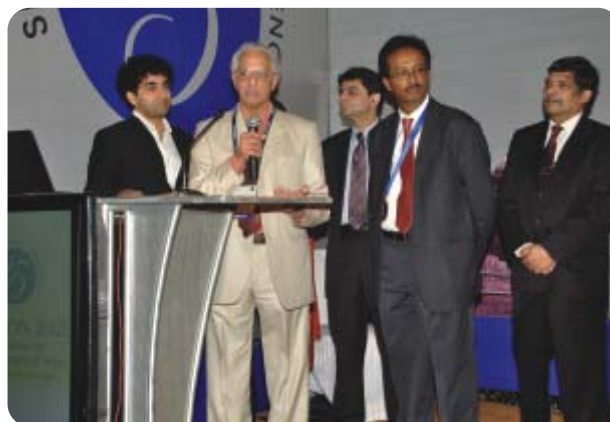
A.S.S.I. Anthem being sung during inaugural ceremony

The Silver Jubilee (25th) Annual Conference of Association of Spine Surgeons of India (ASSICON 2012) was organized by Spine Society – Delhi Chapter at Hotel Le Meridien, New Delhi from 23rd to 26th February, 2012.