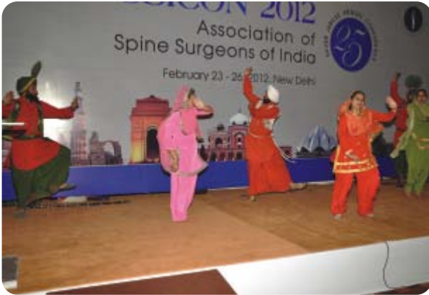
Folk dance during Inauguration ceremony in Le Meridien