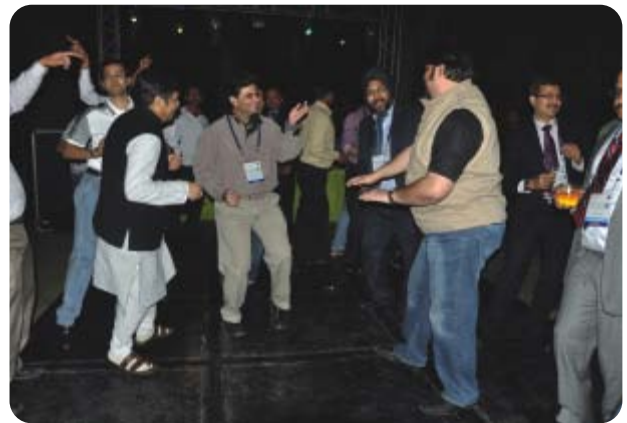
A.S.S.I. members demonstrating dance moves during Gala Dinner