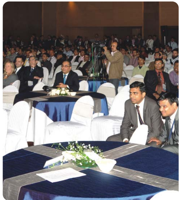
Scientific session in progress