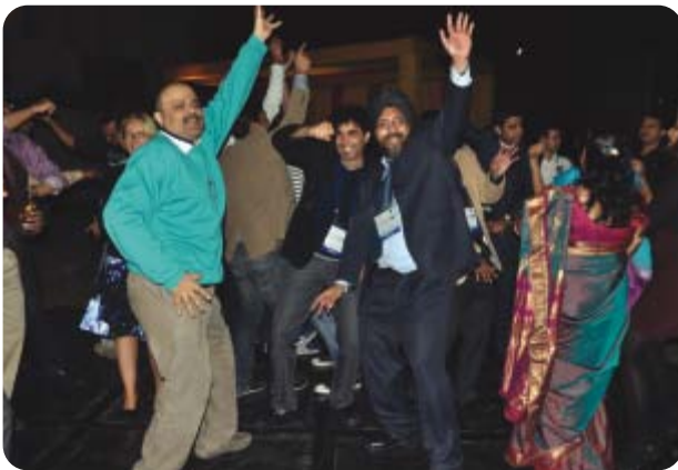
Participants in high spirits