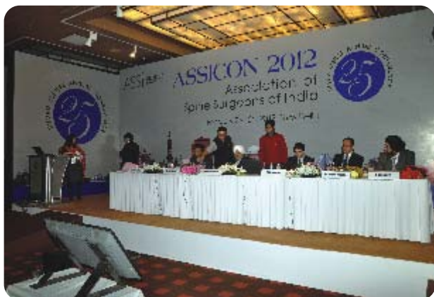
Dignitaries on dias during inaugural ceremony