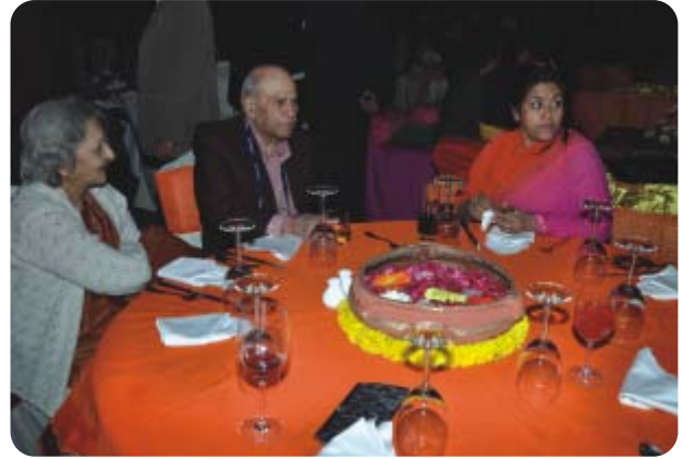
Gala Dinner at Hotel Imperial