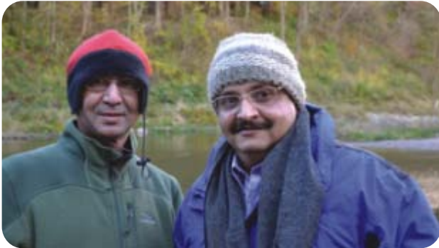
Facing the biting cold