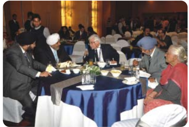
Inaugural Dinner at Hotel Le Meridien