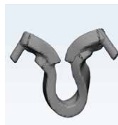
Figure 2) 3D printed jig after uniting the sub parts

Some softwares required for 3DP are available for no additional costs but have limited features. However the better ones with wide range of features are paid. This includes registered versions of OsiriX 10.0, AutoCAD 2019, MedCAD, Blender, Cinema 4D. This 3DP requires association with engineers and at our institute Maulana Azad Medical College and associated LNJP hospital we work in association with IIT, New Delhi. We 3D print pedicular screws and jigs for planning of osteotomies in spine surgery.