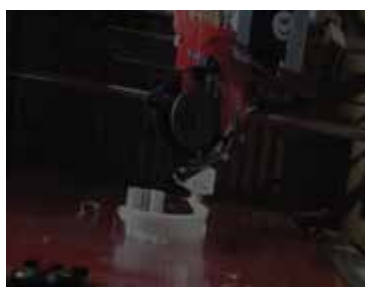
Figure 4) Models created at our institute

THIS VIRTUAL JIG AND CERVICAL SPINE MODEL HAS BEEN PRINTED BY A FDM 3D PRINTER